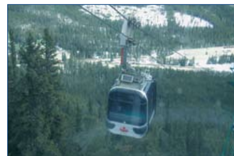
The Banff Gondola