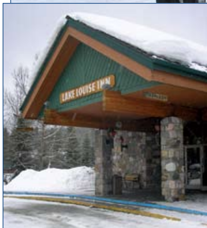
Lake Louise Inn

Last March, I traveled to Lake Louise in Alberta, Canada with my fiancé for three days of skiing at Lake Louise Mountain Resort and Sunshine Village. With 139 trails and over 4,200 skiable acres on four mountain faces, Lake Louise Mountain offers breathtaking scenery and is one of the largest and top-rated ski areas in North America. Known as the birthplace of skiing in the Canadian Rockies, it was also recently ranked one of the top places to ski by Condé Nast Traveler .