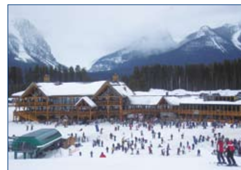
The lodge at Lake Louise Mountain