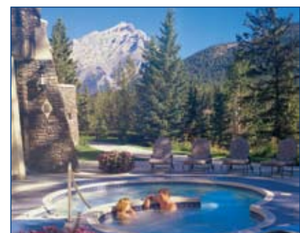
Fairmont Banff Springs Hotel

Mountain Park Canada offers a seven-day "Castles of the Rockies" self-drive tour featuring visits to Lake Louise, Jasper and Banff. You'll stay at the Fairmont Chateau Lake Louise, Fairmont Jasper Park Lodge and the Fairmont Banff Springs Hotel. Rail travel is also an option on this tour. Call your travel counselor for more information.